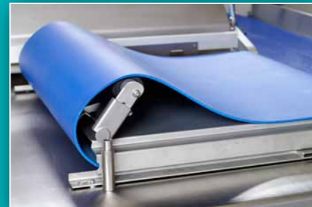
ADVANCED CONTROL SYSTEM