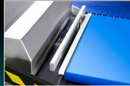
FULL AUTOMATIC SYSTEM